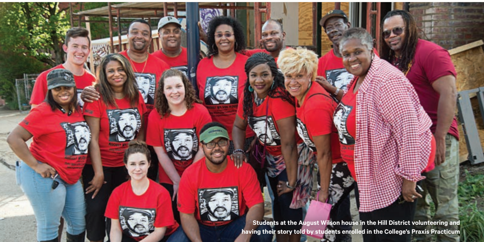
Students at the August Wilson house in the Hill District volunteering and having their story told by students enrolled in the College's Praxis Practicum

2018 McAnulty College And Graduate School Of Liberal Arts