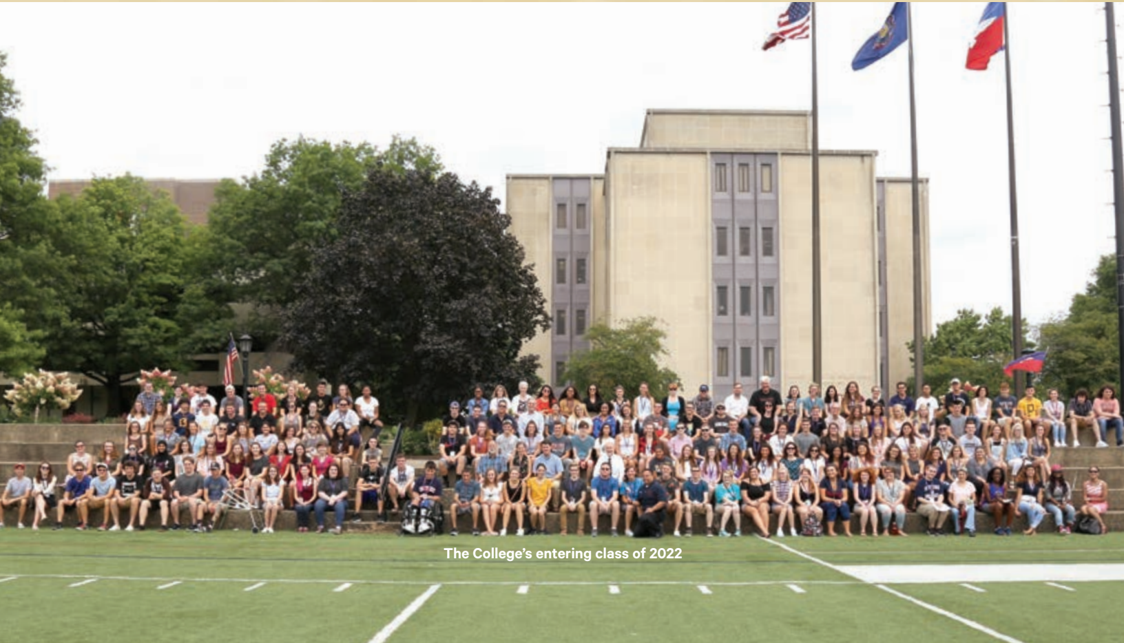
The College's entering class of 2022